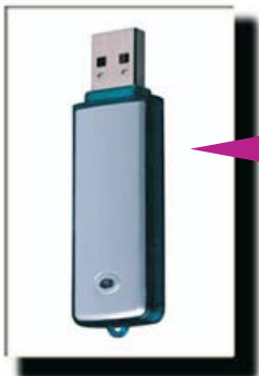
USB Flash Drive Removing Data to PC